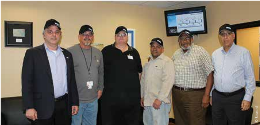
Boccard's top employee donors wearing their Handicap International hats.