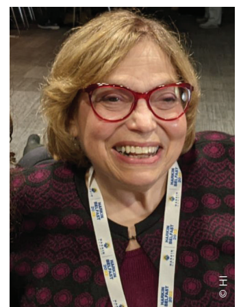
Judith Heumann at the 2022 Harkin Summit in Belfast, Northern Ireland.