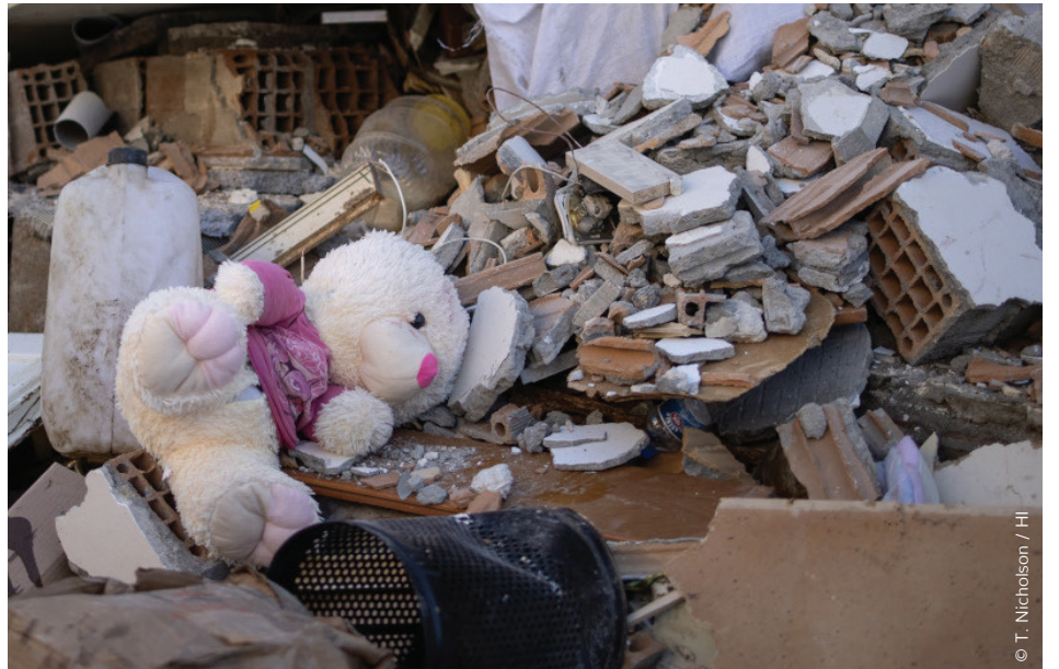
Left: Rema, 13, recovers at a hospital in northwest Syria. Right: Personal belongings are shown in debris from a collapsed building in Türkiye.